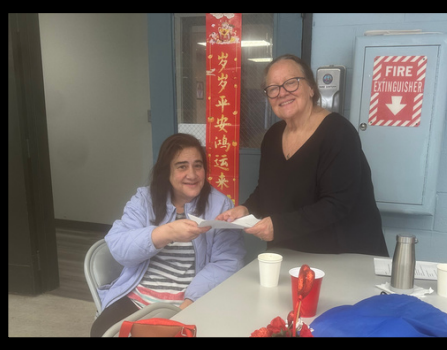
Bergenfield Health Department at Senior