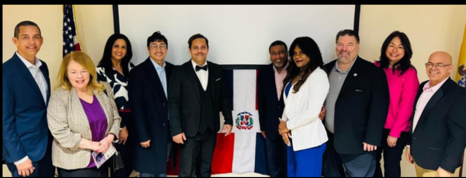
Dominican Heritage Month