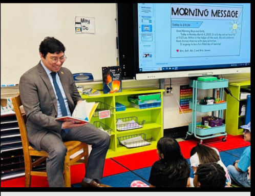
2024 Read Across America