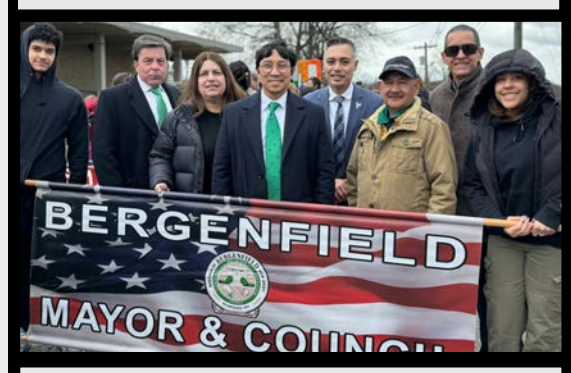
2024 St. Patrick's Day Parade