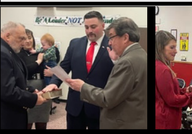
Swearing in of New Fire Fighters