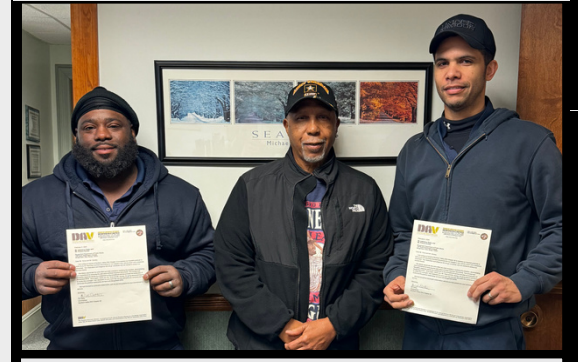
DPW Praised for exemplary service by DAV