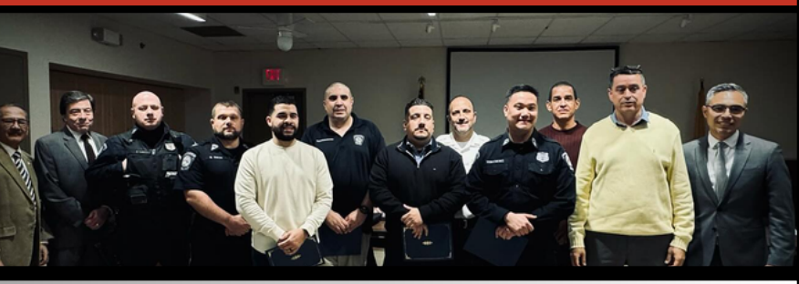
Commendations to our Police officers who responded and