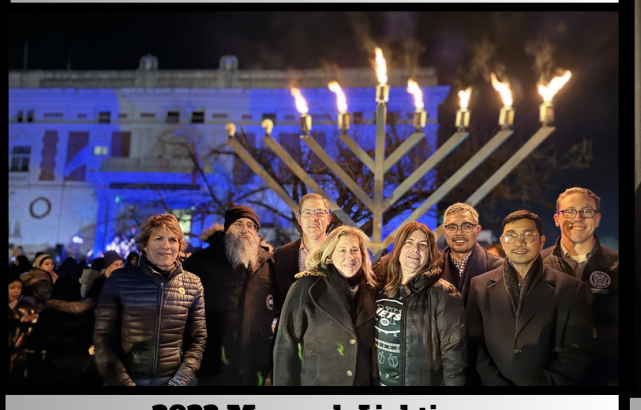
2023 Menorah Lighting