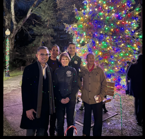
2023 Christmas Tree Lighting