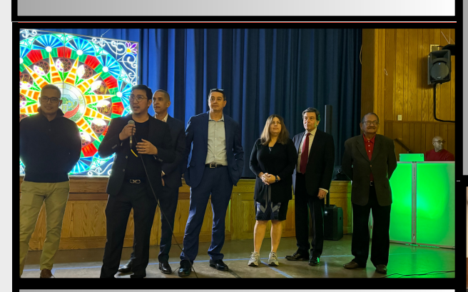
2023 Volunteer Thank You Dinner